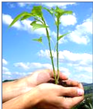
World Environment Day

June 5 is UN World Environment Day, focussing this year on air quality.