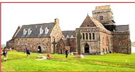
Iona Abbey today

The Irish monk, Saint Columba, is remembered by the church on June 9. He was a powerful preacher and leader, who founded 30 monasteries in Ireland in 10 years. However, his forceful personality led to antagonism, so, exiled from Ireland, he and a