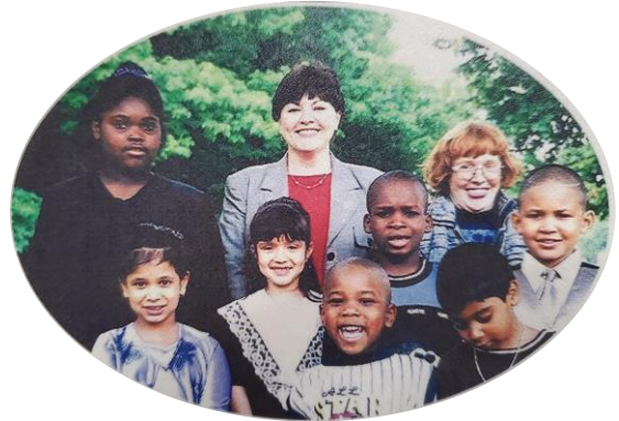
A picture of my first Sunday School class from 2000. I was in the black dress with white lace in the middle row. Some of my fondest childhood memories stem from those years in Sunday School!