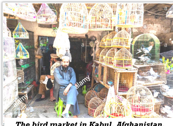
The bird market in Kabul, Afghanistan. The vendor hopes you will buy one of his brilliantly-coloured parrots.